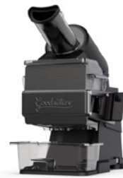
Hummingbird Pro XL

Hummingbird comes in two models – both can be used in home or high demanding commercial environments.