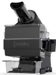
Hummingbird Pro XL